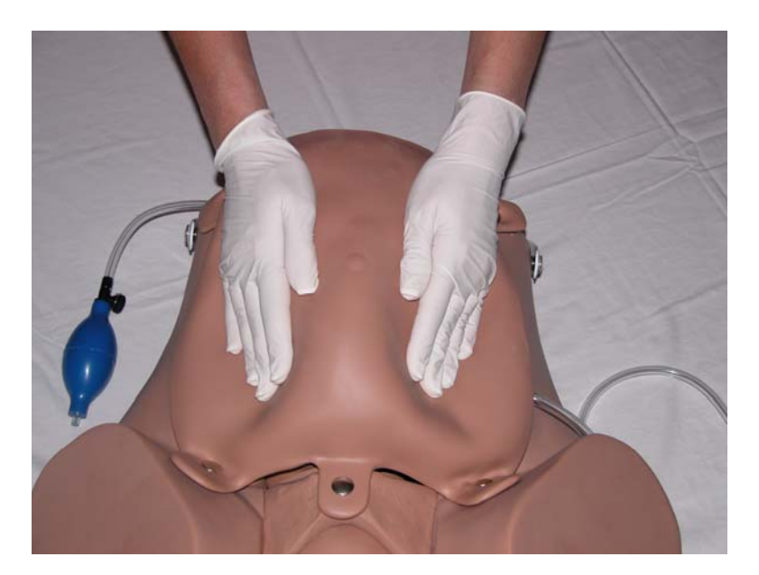
Maneuver 2 - Where is the fetal back?

The second maneuver determines whether the bony spine is directed anteriorly, posteriorly, or laterally. The back and the spine feel like a hard, resistant structure, whereas the other side feels more like a number of nodules.