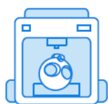
3D Design + Printing