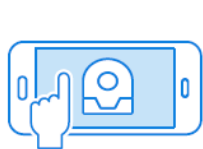
Mobile Play + Programming

This guide provides important information for getting started with your robot.