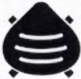
N-95 face mask

Dust is generated when working with dry glaze mixture. To minimize exposure to dust and/or crystalline silica, cutting or sanding dry clay/glaze products should be conducted with sufficient ventilation. Respirable dust and quartz levels should be monitored regularly. Dust and quartz levels in excess of appropriate exposure limits should be reduced by feasible engineering controls, including (but not limited to) wet sanding, wet suppression, ventilation, and process enclosure. When such controls are not feasible, NIOSH/MSHA approved respirators must be worn in accordance with a respiratory protection program which meets OSHA requirements as set forth at 29 CFR1910.134 and ANSI Z88.2-1080 "Practices for Respiratory Protection". In most cases, a disposable N-95 Particulate Respirator is sufficient.