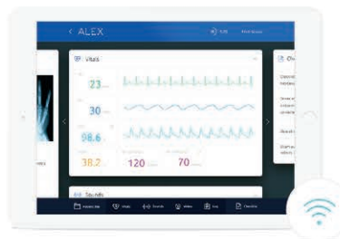
Included wifi tablet for simulator setup & use

Create new patients by customizing vitals, checklists, patient file and all speech questions and responses. Share and collaborate with other ALEX/PCS users.