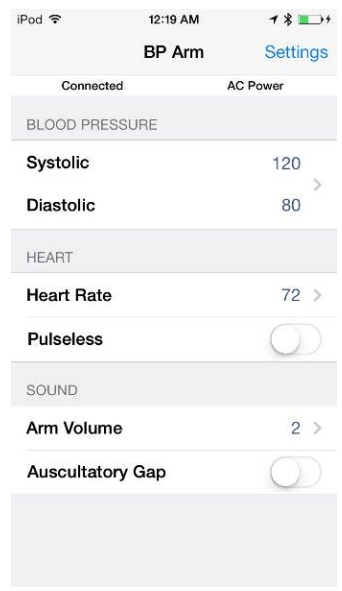
Opening screen display