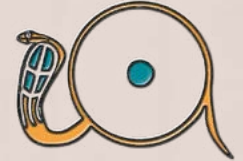
Sun God Ra — his name is thought to mean creative power