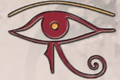
Eye of Horus — amulet against injury and evil