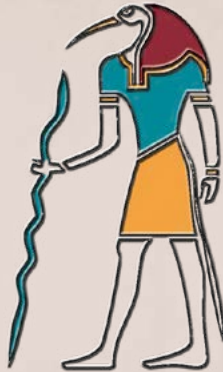
Thoth, a moon deity — god of writing, counting, and wisdom.