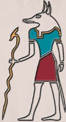
Anubis, a god of mummification — protected the dead from deception and eternal death